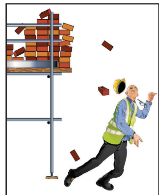
An accident that resulted in an injury or damage

It really does help to prevent accidents