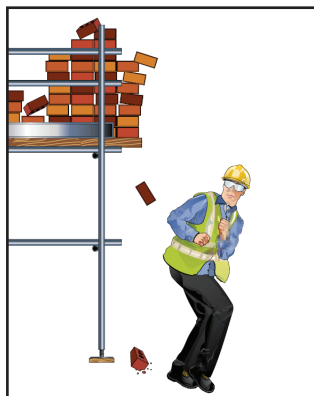
An incident that nearly resulted in an injury or damage